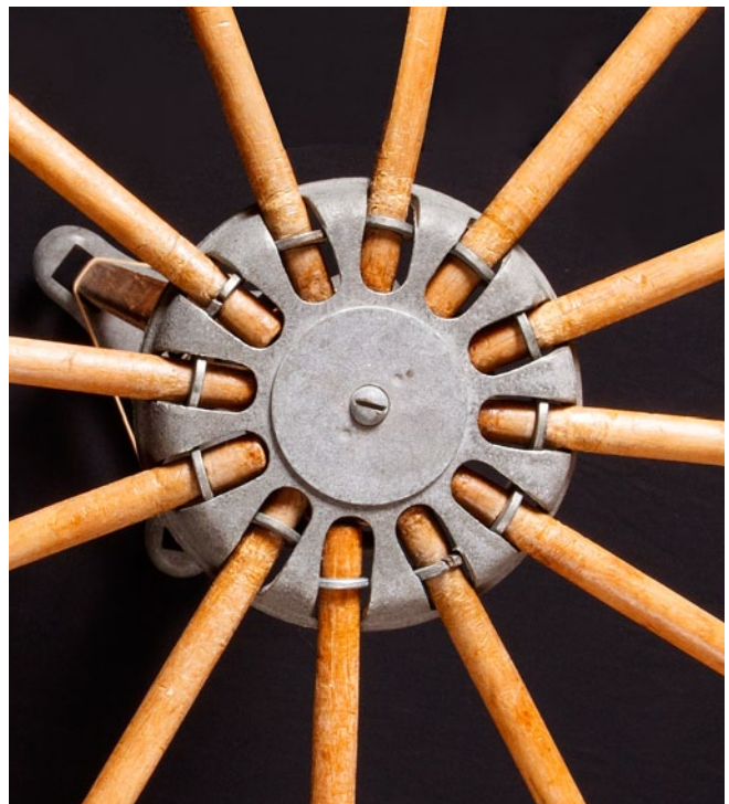
Fig. 6. top view (close up).