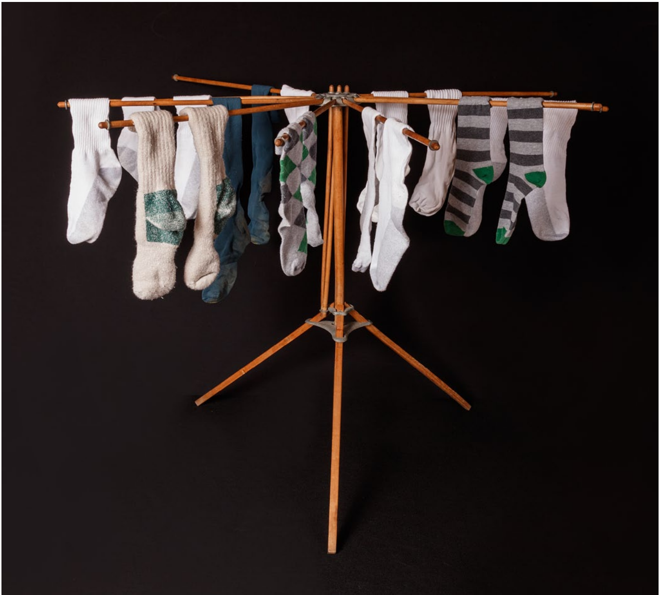
Fig. 7. Side view (artifact fully open).