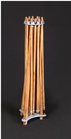
Fig. 2. Side view (fully folded).