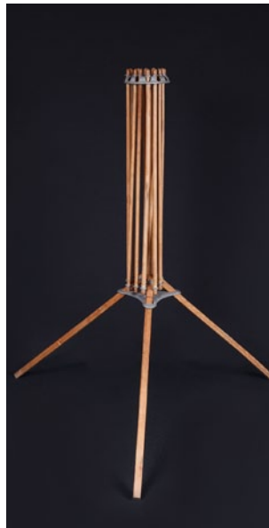
Fig. 3. Clue photo seen in Fig. 1.