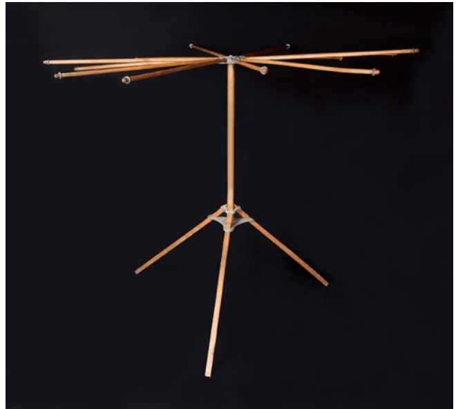
Fig. 4. Side view (fully open).